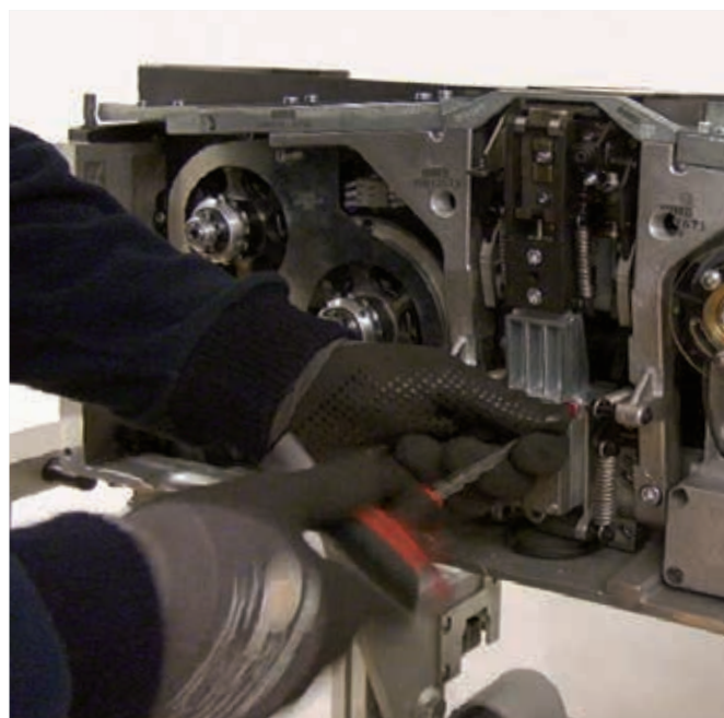
Detail of fast replacement of Welding Group.