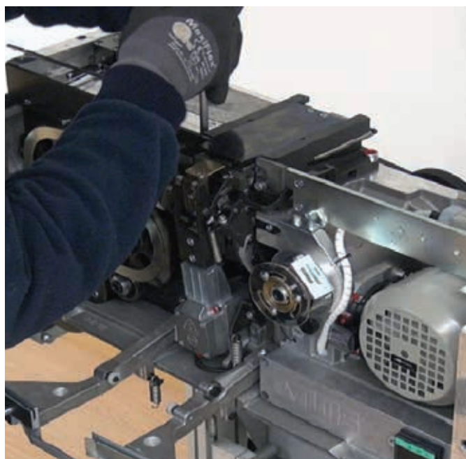
Detail of fast replacement of Clamping Group.

The head is available in two different models: Standard and TR1400HD version (with blade cleaning system and knurled pliers).