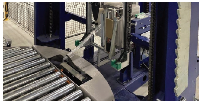
Welding & Cutting device