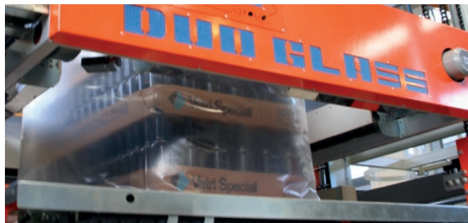
Shrink cycle detail

Gas pressure reducer kit (Max pressure input 8bar)